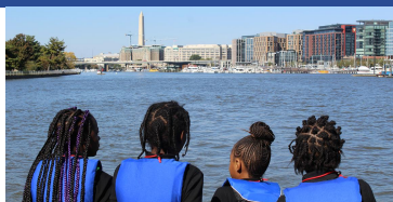
Opinion Piece: Chesapeake Bay Foundation

Bringing the Bay Home: Saving the Bay Requires