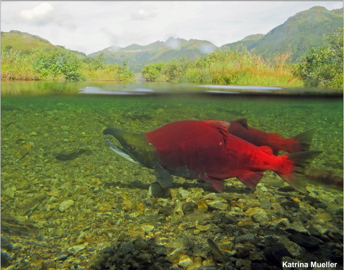
Sockeye salmon ( Oncorhynchus nerka )