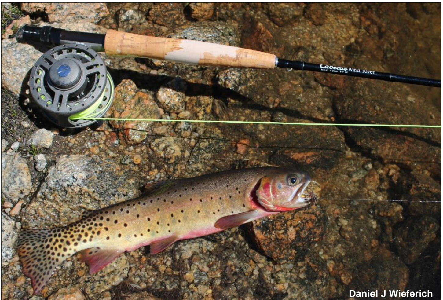
Cutthroat trout ( Oncorhynchus clarkii )

It is important to recognize that these broadly-defined disturbance variables often act together with other measured or unmeasured threats to degrade habitat. Thus, while we may identify “urbanization” as a major threat to fish habitat in some regions, “urbanization” represents an umbrella term that describes the many facets of urban development that could cause degradation to habitats, such as the amount of pavement that changes stream flows, nutrient runoff from lawns, road salt runoff, trash and detergents getting into the river, etc. Rarely does only one disturbance type act alone.