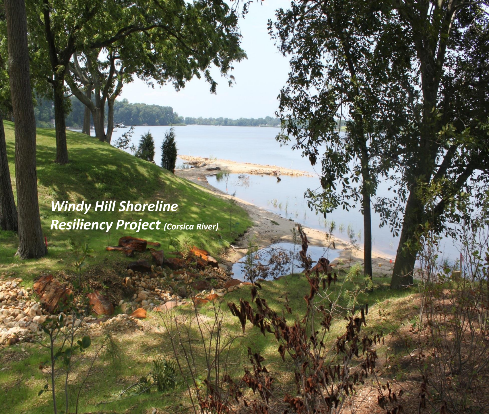
Windy Hill Shoreline Resiliency Project (Corsica River)