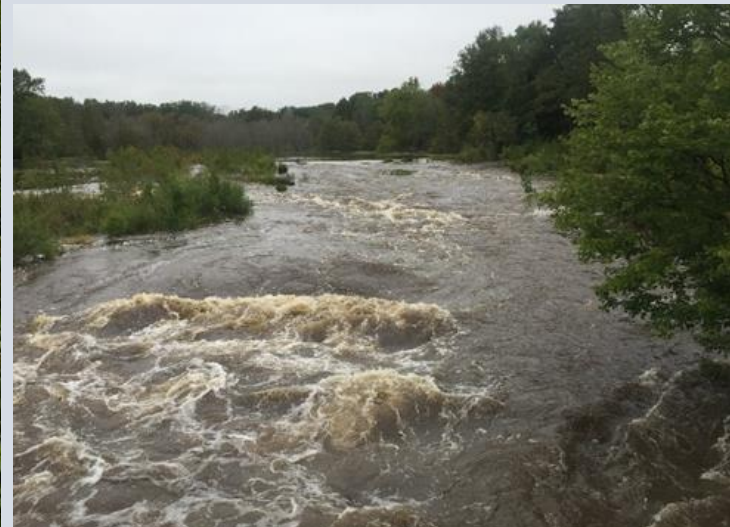
After 9" Storm Event