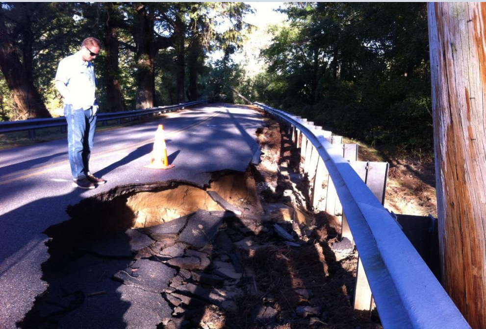
Big Mill Dam (Worcester CO.)