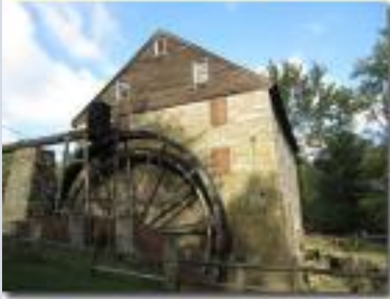
Rock Run Mill