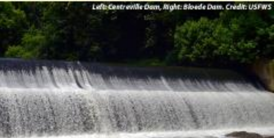
Left: Centreville Dam, Right: Bloede Dam.

Historic Dam Structures Are Ubiquitous Across the Mid-Atlantic Region