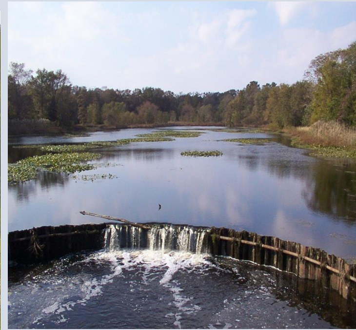
Prior To Dam Removal