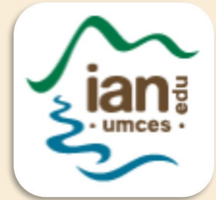
Government Relations Intern