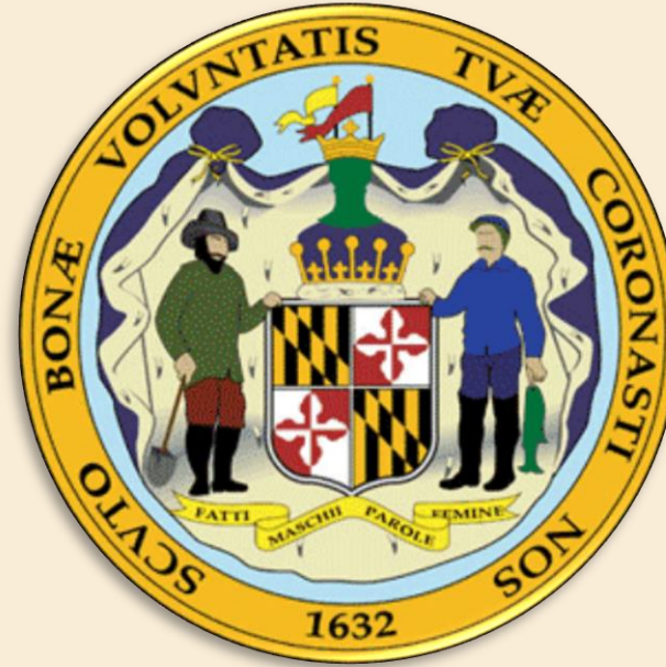
State Senator Campaign Management Intern