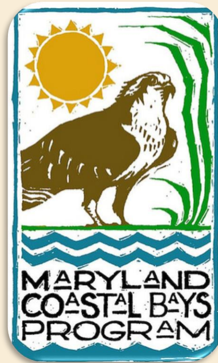
Environmental Policy Intern