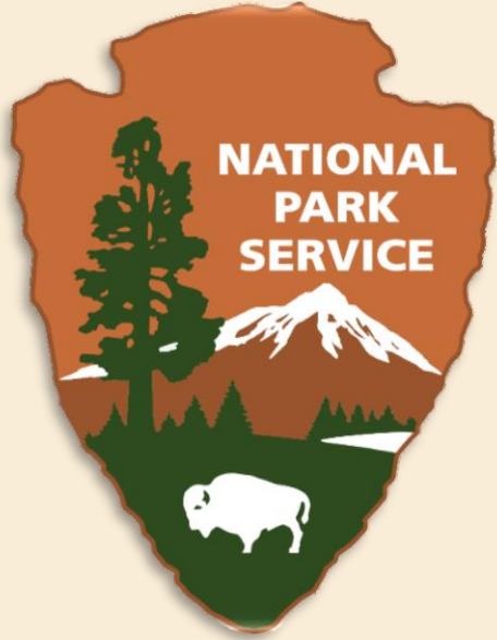
Student Intern at Assateague